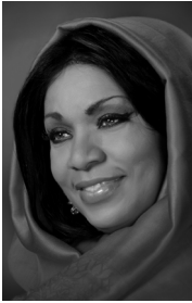
Leona Mitchell Soprano

OSU is honored to present an Honorary Doctor of Fine Arts to Leona Mitchell in recognition of her successful professional career, her outstanding philanthropy and public service, as well as her service as an advocate for student success.